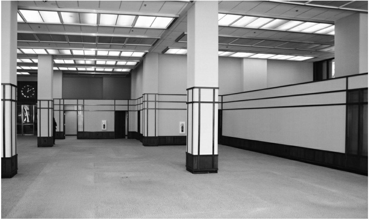
Office space prior to BNIM renovation.