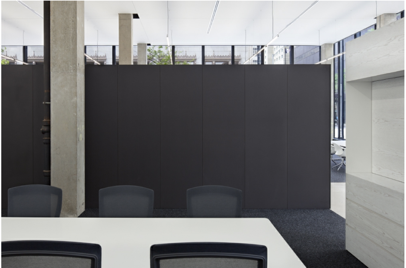
BNIM office conference room.