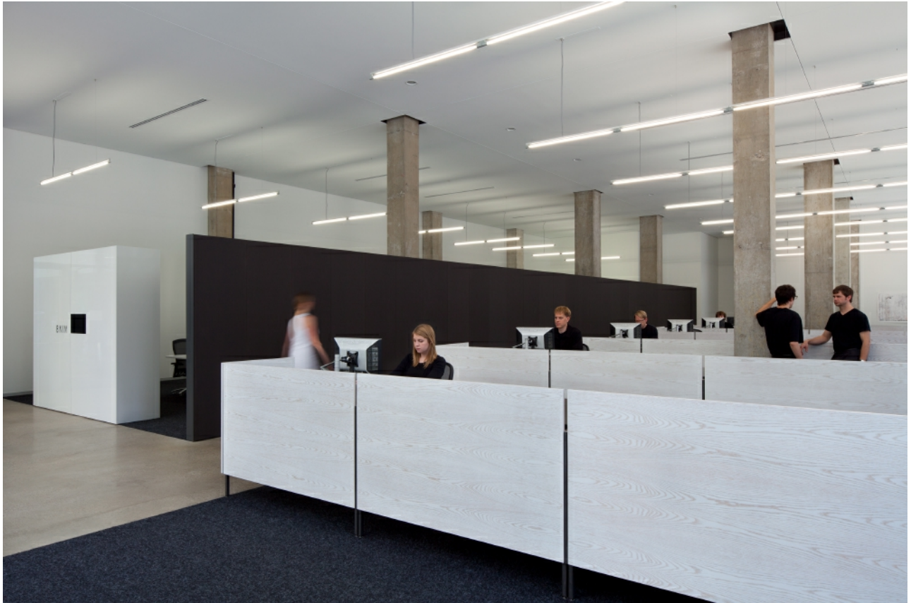
A cork paneled wall divides the office in two.