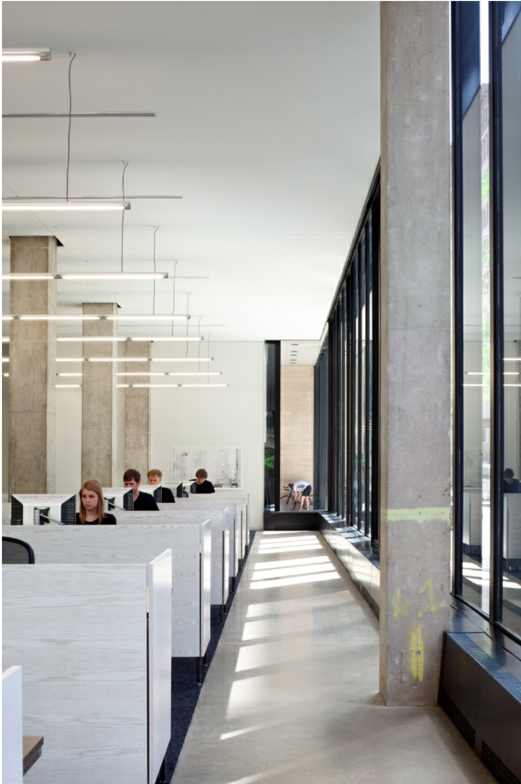
The day-lit studio space of the BNIM office.